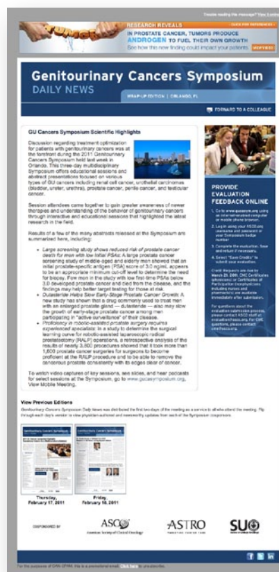
GU Daily News eBLAST Screenshot

JPG, GIF, Click-through URL. No Rich Media can be accepted.