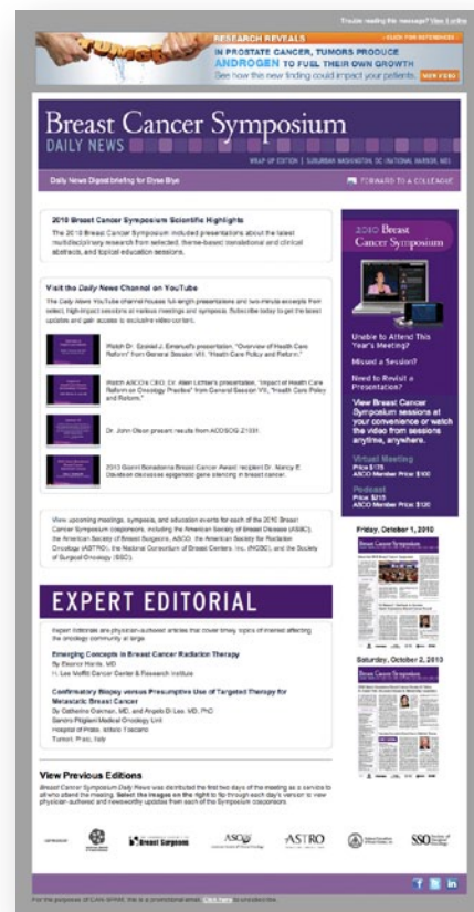
Breast Daily News eBlast Screenshot

JPG, GIF, Click-through URL. No Rich Media can be accepted.