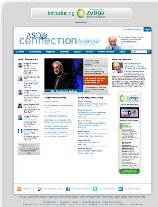
ASCO Connection Website Screenshot

Limited to a maximum of three loops per 45 seconds for animated creatives. User enabled media is allowed.