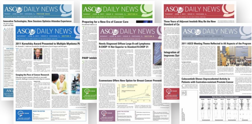
ASCO Annual Meeting Daily News