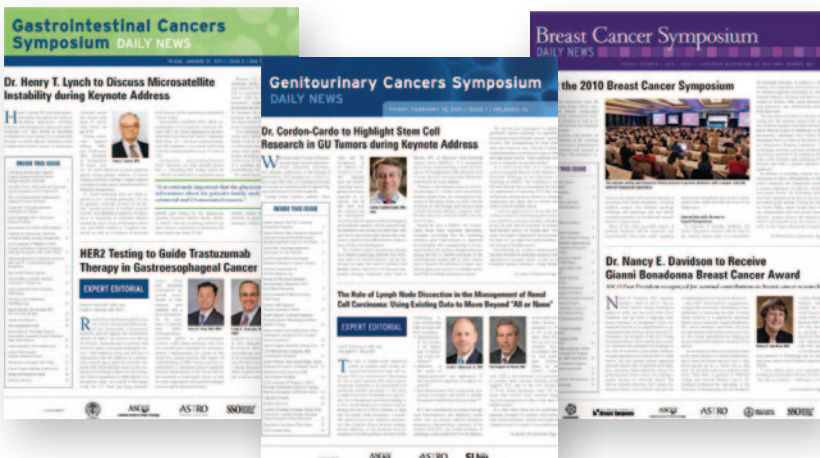
Symposia Daily News