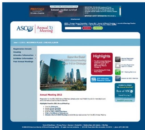
ASCO Annual Meeting Registration Microsite Screenshot

This site contains all information pertinent to ASCO's Annual Meeting including registration, meeting program, attendee and exhibitor information, as well as links to all Meeting products.